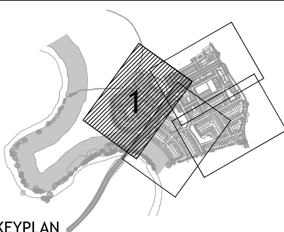
SITE KEYPLAN SCALE: NOT TO SCALE